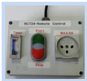
Timer Controller Box