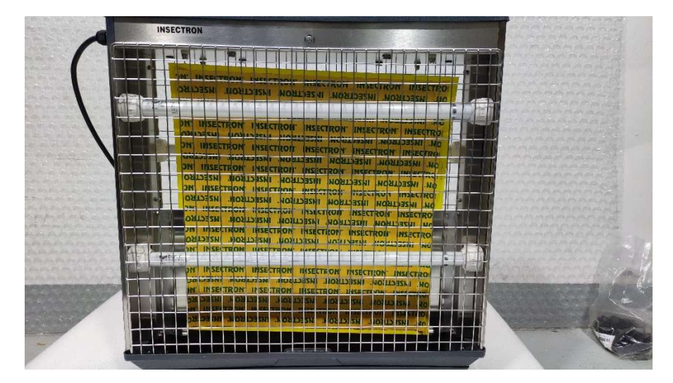
New type Safety grid with smaller size holes made from SST-304 material

Comparison between original used and new type. Note the original type was made from galvanized steel